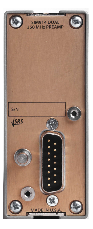
Figure 1.1: The SIM914 front and rear panels.

The full scale input is \pm 200 mV. The input noise (above 1 kHz) is typically 5.2 \text{ nV}/\sqrt{\text{Hz}} . The output is linear over \pm 1 V and should be terminated into a 50 \Omega load. Output rise and fall times are 1.3 ns. The output will recover from a 10\times full-scale overload within 3 ns. The unit is protected from \pm 50 \text{ V} , 1 \mu \text{s} input overloads.