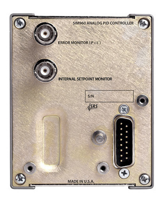
SIM960 rear panel