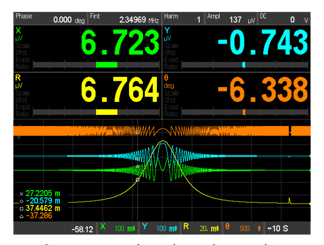
Large numeric readout with strip chart recording

The SR865's effective dynamic reserve is simply the ratio of these two settings. For instance with a 10nV sensitivity setting and a 300 mV input range the effective dynamic reserve of the SR865 is 3 \times 10^7 , or nearly 150 dB.