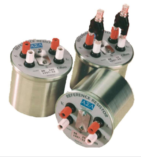
Model 5695 reference resistor with different resistance range