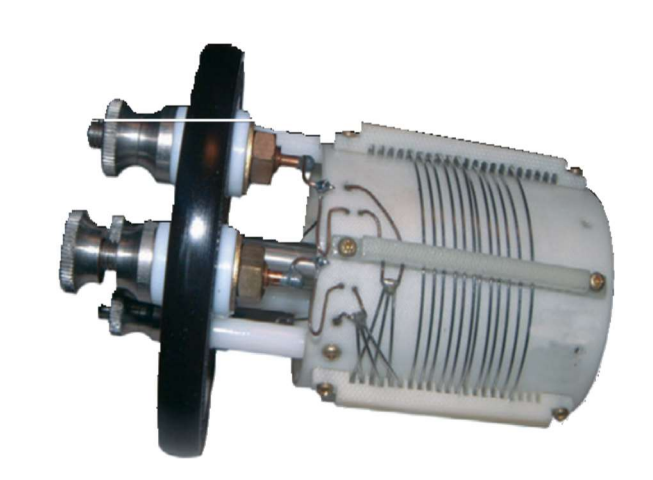
Standard reference resistor, model 5685

Since the introduction of these standard reference resistors they have been adopted by many major industrial companies as their primary resistance reference standards. Information obtained from laboratories over the past twenty-five years indicate their exceptional high specification. With monitored examples exhibiting stabilities within 1 ppm over a period of ten years.