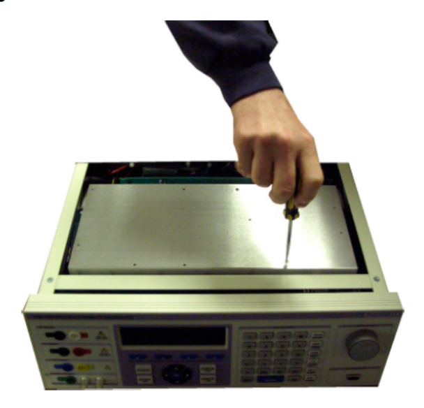
Remove the top screening cover of the PCB – remove all nylon fixing screws, plus 1 metal screw from far end of PCB cover.

5. The Processor is located in the front right hand corner of the Top Board PCB. Note the orientation of the processor and then gently lift the processor straight up. To insert the new processor, line up the pins of the processor with the socket, noting the orientation of the processor and then push the processor into the socket, ensuring that the processor is inserted evenly and all pins are making good contact with the socket.