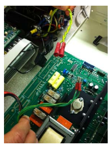
SEPARATE BULLET CONNECTIONS FROM REAR PANEL LEADS