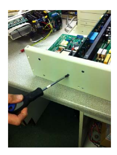
REMOVE SIDE FIXING SCREWS WHICH HOLD THE MIDDLE BOARD IN PLACE