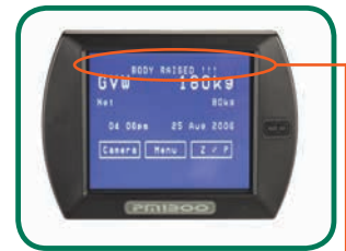
Body Raised Indicator