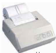
Heavy duty printer