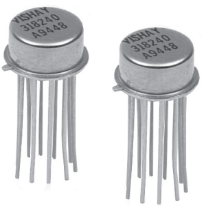
Product may not be to scale

The eight pin TO-5 package with 0.230" pin circle is an alternative layout to Model 1413. This network can contain up to 12, V5X5 resistor chips.