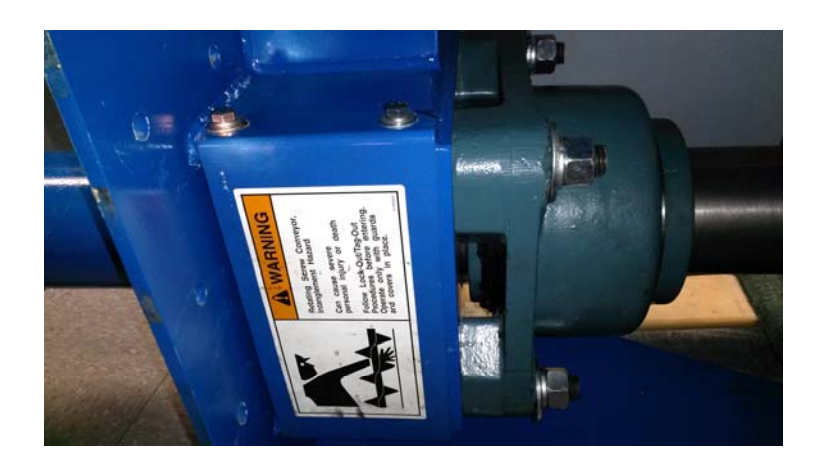
B: Strain gage area with its protective cover