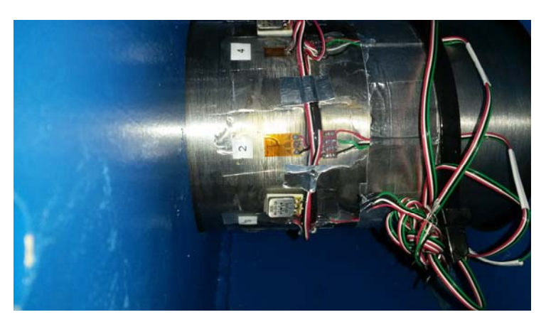
Picture 5: Strain gages installed on the reclaimer screw shaft: two full-bridges in shear patterns (torque) and two half-bridges in linear patterns (bending)