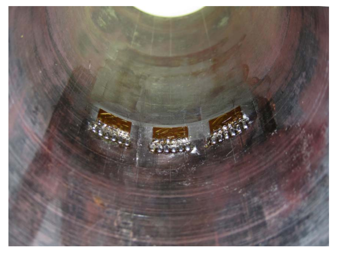
Figure 1: Photograph showing three hole-drilling strain gage rosettes installed on the pipe's inner diameter

Micro-Measurements CEA-06-062UL-120 strain gages were used in this application due to their small size and high durability. Hill Engineering designed and manufactured a special guide tool to allow precise and secure mounting of strain gages in pipes of varying diameter and length (Figure 1).