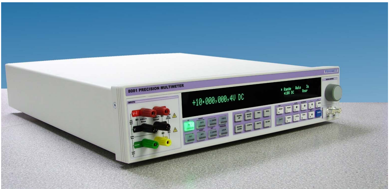
Figure 2: Transmille 8081 precision digital multimeter

http://www.transmillecalibration.com/category_s/46.htm and http://www.transmille.co.uk/8000_multi_menu.htm .