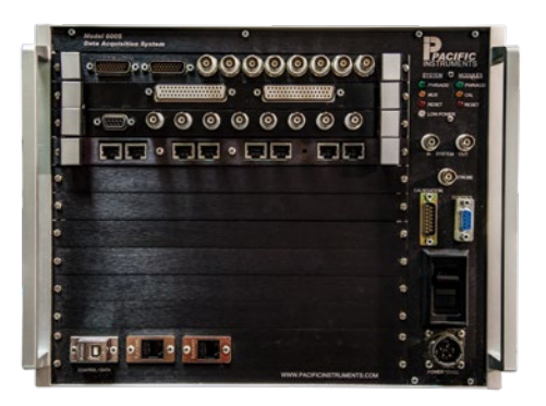
Pacific Instruments Series 6000 Data Acquisition System