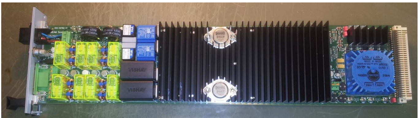
Figure 1: Design photo of first prototype board, top view

In addition, the VCS332Z undergoes post manufacturing operations (PMO), including short-time overload, accelerated load life, and temperature cycling. VFR resistors are inherently stable as manufactured; however, these PMO exercises improve their performance by small but significant amounts.