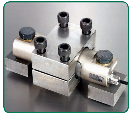
LFT1500 Load Cell

The unique 'flexible' mounting bracket allows the chassis to 'twist' enabling greater accuracies; together with the chassis inclinometer, accuracies of 20 kg are standard. The 1800 weighing instrument displays large easy-to-read characters and features options such as Bluetooth.