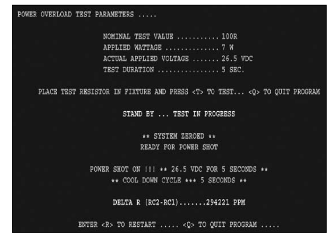
Figure 3. STO for thin film resistor