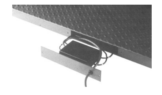
Integral Junction Box