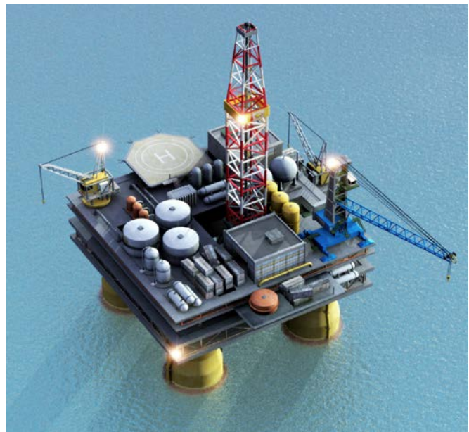
Figure 3: Jack up rig

“Perfect products for offshore environment”