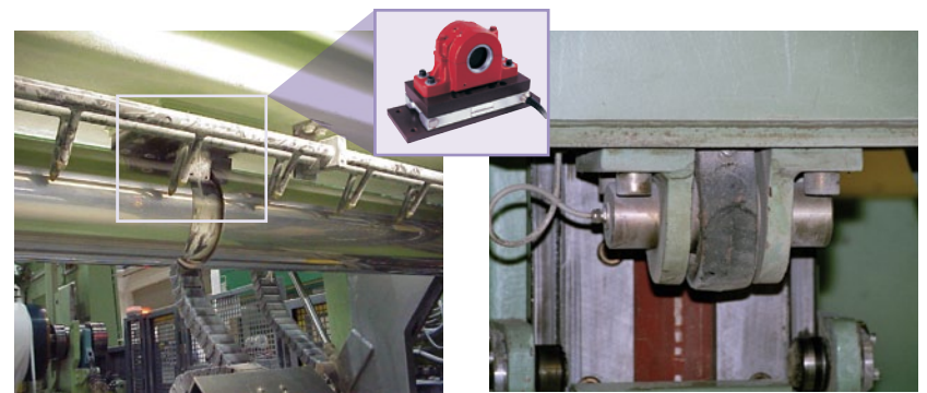
Load cells in the bearing bracket

This allows for optimum control of the rider roll's linear force.