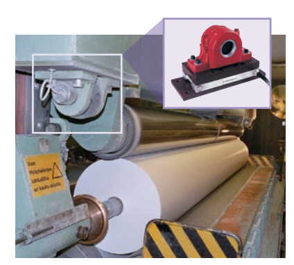
Load cells mounted under rider roll