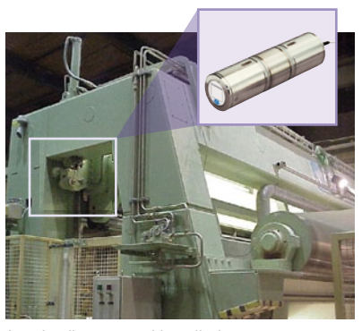
Load cells mounted in cylinders

We offer assistance and support in both planning and installation.