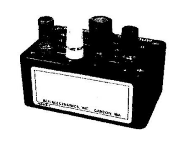
Figure 1-1. The Model 125 Calibrator

The model 125 pocket calibrator (Figure 1-1) is a portable, lightweight simulator designed to supply millivolt-per-volt (mV/V) level signals for testing and calibrating load cell/scale indicators. Precise output references for 0, 1, 2, or 3 mV/V are achieved by using a metal film resistor network, discrete wire wound resistors, and a 2-pole, 4-position rotary switch. The 350 ohm input and output impedance matches typical strain gage devices. Four permanent binding posts, integral to the rugged palm-size case, provide connection points for the indicator or transmitter.