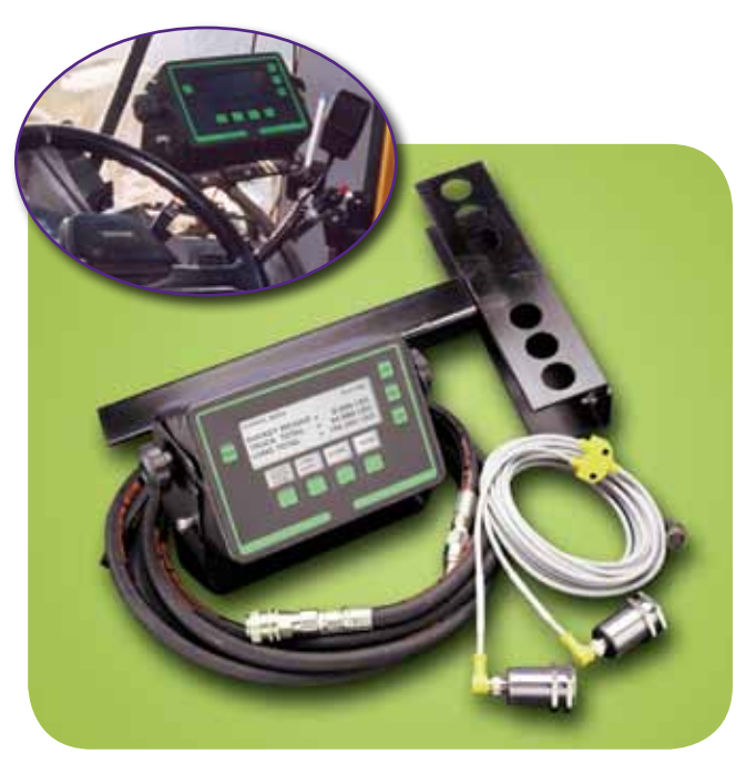
Tuffer comes complete with all parts required for installation.

With installation of the optional printer, you can get all the weight data printed in the cab, saving time and money.