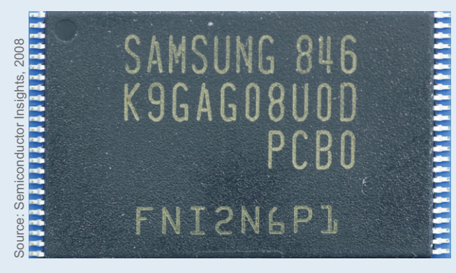
Package Photograph of the Samsung 42nm 16 Gbit NAND Flash

Toshiba, IM Flash Technologies, Hynix, Numonyx