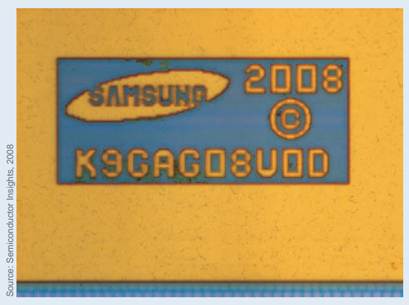
Die Markings of the Samsung 42nm 16 Gbit NAND Flash