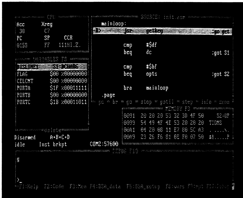
Figure 1. Debug Screen