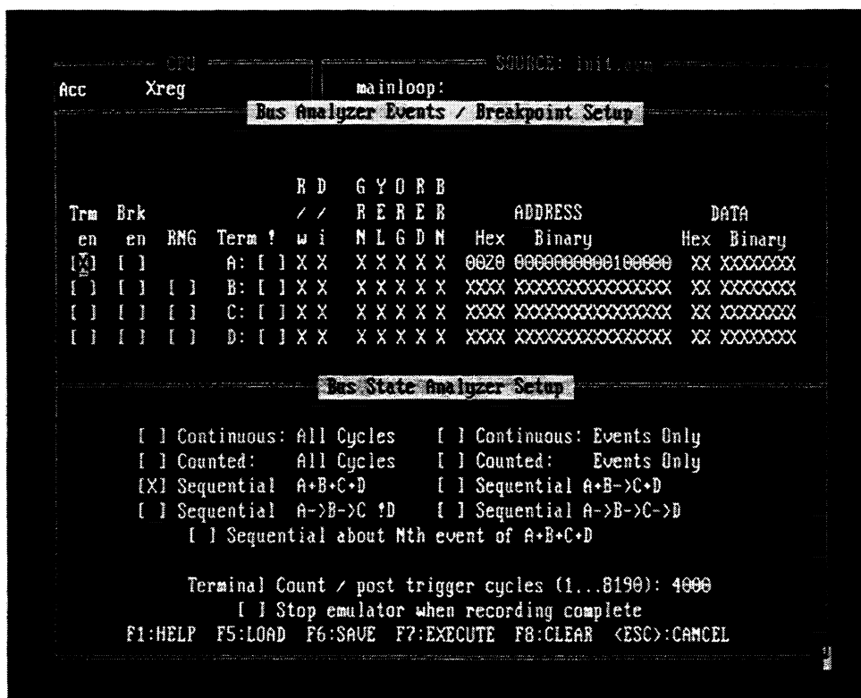
Figure 2. BSA Setup Window