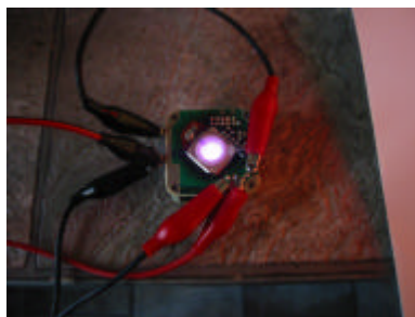
Figure 2, proper Rb ignition